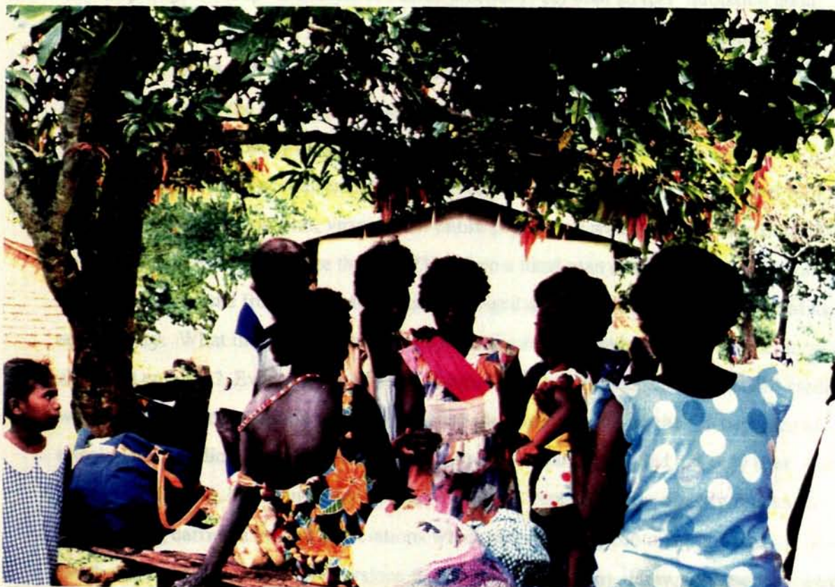
Plate II (above): Members of the Simbo UCWF marching at the annual Simbo-Ranongga Inter-circuit Rally, Simbo 1990.