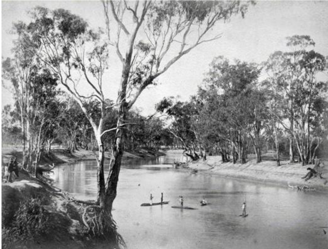
This picture shows traditional fishing in Bark Canoes on the Murray (Dhungulla) at the Old Maloga Mission, during the 1870s. 2

"THE BARMAH FOREST IS OUR ANCESTRAL HOME. CUMMERAGUNJA IS SPECIAL" 1 : DHUNGULLA AND THE IMPORTANCE OF PLACE.