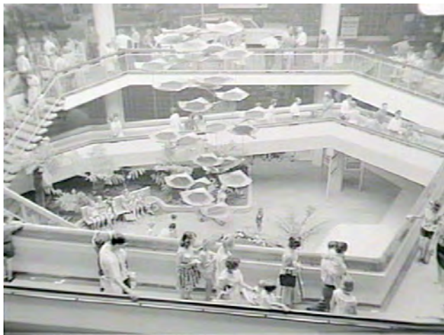
Figure 3.4: Miranda Fair interior, 1964 SRL NSW, New suburban shopping centre series, Government Printing Office 2 – 25901, 21 March 1964.

Casualness suited the values and aesthetics of the expanding suburbs. Warringah Mall advertised that its ‘modern and elegant buildings, the convenient location, the covered walks, the open courts, gardens and fountains add[ed] up to a warm friendly market place’. 33 David Jones store had ‘avocado-green’ columns [to] enhance the coolness of the air-conditioning. 34 Grace Bros Homemakers Store at the Mall had an ‘ultra-modern ceiling where a gradation of sunny yellows... [sought to] inspire a feeling of fresh air and sunshine’. 35 When it was converted into a full three-floor department store in 1973, it was advertised as offering ‘A bigger slice of the good life’. 36 An air-conditioned court that featured landscaped rockery and a modernist fountain linked Miranda Fair’s three hexagonal buildings. Customers accessed the court through thirty-foot-wide sliding glass doors at the push of a button; and they could relax with up to eighty of their peers in the ground floor espresso bar surrounded by teak fittings and colonial furniture. 37 ‘Soft mushroom vinyl floors’ lay underfoot in the hairdressing salon where women could relax in the lavish blue interior, assured of a fashionable outcome under the