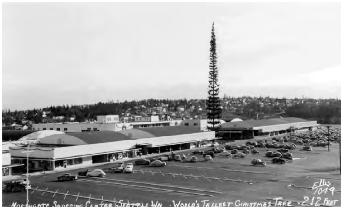
Figure 1.4: 'Northgate Shopping Center, c.1950'

The first suburban shopping centres that used department stores as anchor tenants began appearing in the 1950s, as the major city stores followed their customers out from the city. A significant early development was Northgate, opening in Seattle in 1950. Northgate stood next to a highway and was surrounded by parking for 4,000 cars.