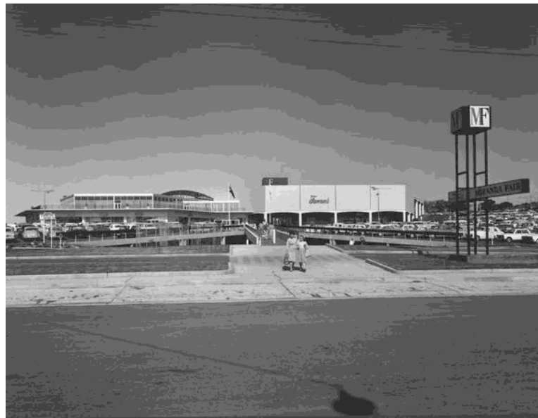
Figure 2.6

both countries. 141 In Sydney, Benjamin's saw Top Ryde as 'far from... a slavish imitation of American regional shopping centres'. 142 The Daily Telegraph concurred, describing the interest that Top Ryde had generated around the country and across the world. American retail executives even visited the centre! One wished he had 'a few dollars invested in it'. 143 The managing director of Farmer's described Miranda Fair as 'equal to any similar development in the world'. 144 While 'the best American ideas' had been used, 'Australian brains and drive' were responsible for its rapid construction. 145 Grace Bros executives claimed that American shopping centre experts showed considerable interest in Roselands. 146 The Sydney Morning Herald reported that its compact three-level layout and decked car park improved on 'wasteful' American 'sprawl'. 147 If early Australian developers did bring innovations to international designs the density of suburban development, and in Sydney the topography of the city, were creative constraints. Both prohibited the expansive single-level construction that had occurred in the United States.