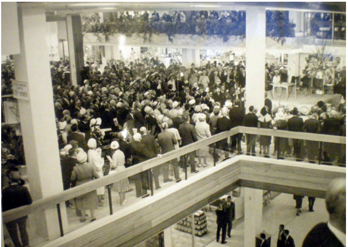
Figure 3.9: Roselands opening ceremony, October 1965

previous year he had not seen such an impressive shopping centre. Sutherland's Shire President congratulated Farmer-Myer on its 'splendid choice' of site, marvelling at the 'rock courage [taken] to spend £3.5 million on this wonderful development'. 149 At the end of 1965, new premier Robin Askin declared that Roselands' 'million dollar spread of merchandise... brings the city to the suburbs in a glittering way that must rival even the fabled Persian Bazaars'. 150 A year later he described Bankstown Square as 'private enterprise at its best': a monumental business achievement that would 'help keep New South Wales as the leading State in Australia'. 151 As opposition leader in 1963, he had declared Warringah Mall 'a tribute to the prosperity of Australia'. 152