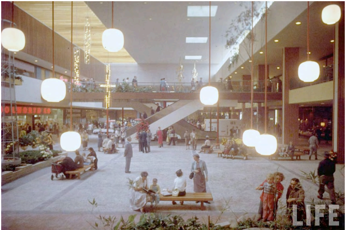
Figure 1.5: Grey Villet, 'Shoppers in interior Garden Court w/ stairway to upper level in Southdale Regional Shopping Center', Life Magazine , vol. 41, no. 24, 10 December 1956, p. 61.

design solved a long-term problem faced by multi-storied shops: how to attract people beyond their scope of vision to higher floors. The central court area opened up Southdale's two floors, revealing selectively displayed public art, glittering merchandise displayed in multiple shop windows, and the activities of other shoppers. This design, combined with parking lots that had entrances onto both levels, rendered the historical dominance of the ground floor obsolete.