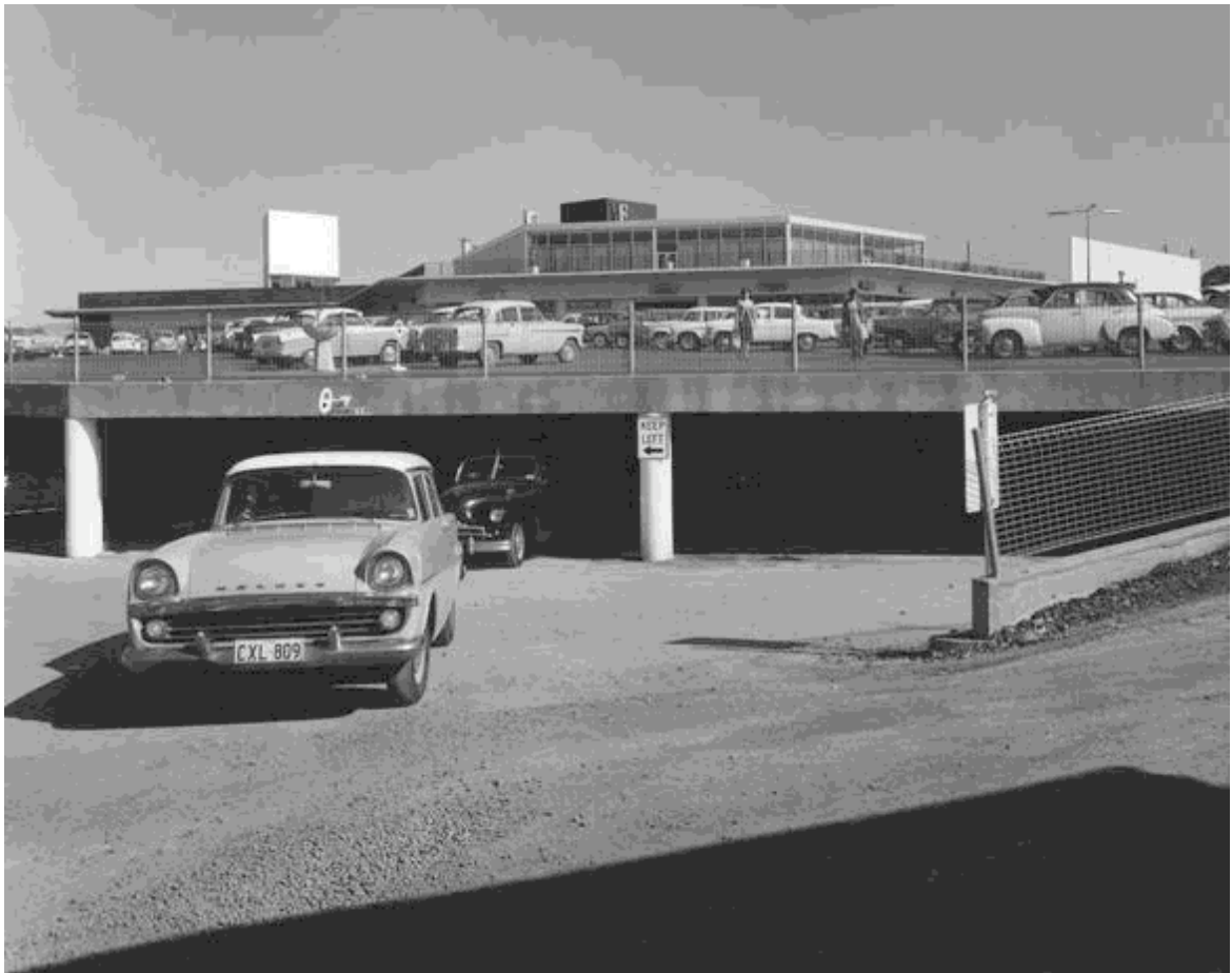
Figure 2.1: ‘Miranda shopping centre, Sydney’

Newtown, but also in some major suburban centres. The most notable of these was Bondi Junction where, despite the level of development, there was little off-street parking other than on the roof of the Grace Bros store. T.W. Beed concluded that ‘the provision of adequate parking space’ was ‘one of the most significant problems confronting’ metropolitan shopping areas. 22