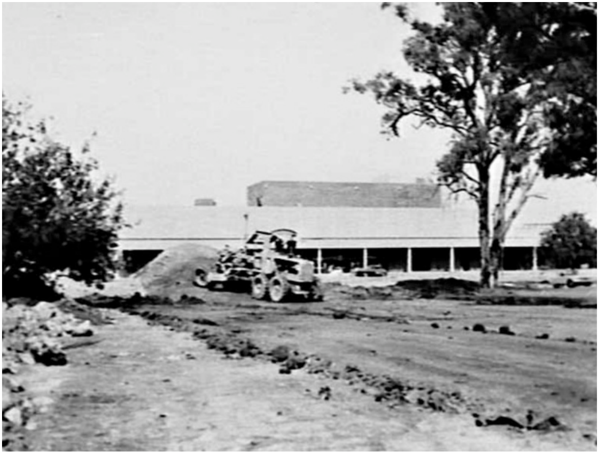
Figure 2.2: 'Bulldozing the car park, Bankstown Square'

with fifteen percent coming by bus and only five percent walking. 32 On average the Mall welcomed 70,000 vehicles a week. 33