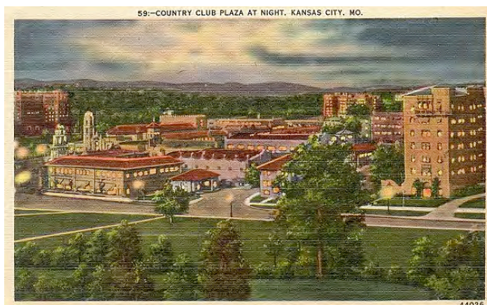
Figure 1.3: J. C. Nichols Country Club Plaza, Kansas City, c1920s

Purpose built department stores began spreading across American cities in the 1890s. 16 In the 1920s, American retailers began placing free-standing general merchandise stores at busy intersections on the expanding public transport networks that serviced the suburbs of American cities. These attracted other retail outlets, creating unified shop fronts and an assortment of traders. 17 Such shopping strips became commonplace in cities across the country by the end of the decade, but soon experienced parking shortages and considerable traffic congestion. 18 Developers sought models that would more comfortably marry cars, people and retail. 19 In 1923, four miles south of Kansas City, the J. C. Nichols Country Club Plaza, opened with extensive free parking an integral element of its design. Kenneth Jackson argues that when Jesse Clyde Nichols organised retail into this single car-friendly development, he ‘created the idea of the planned regional shopping center.’ 20