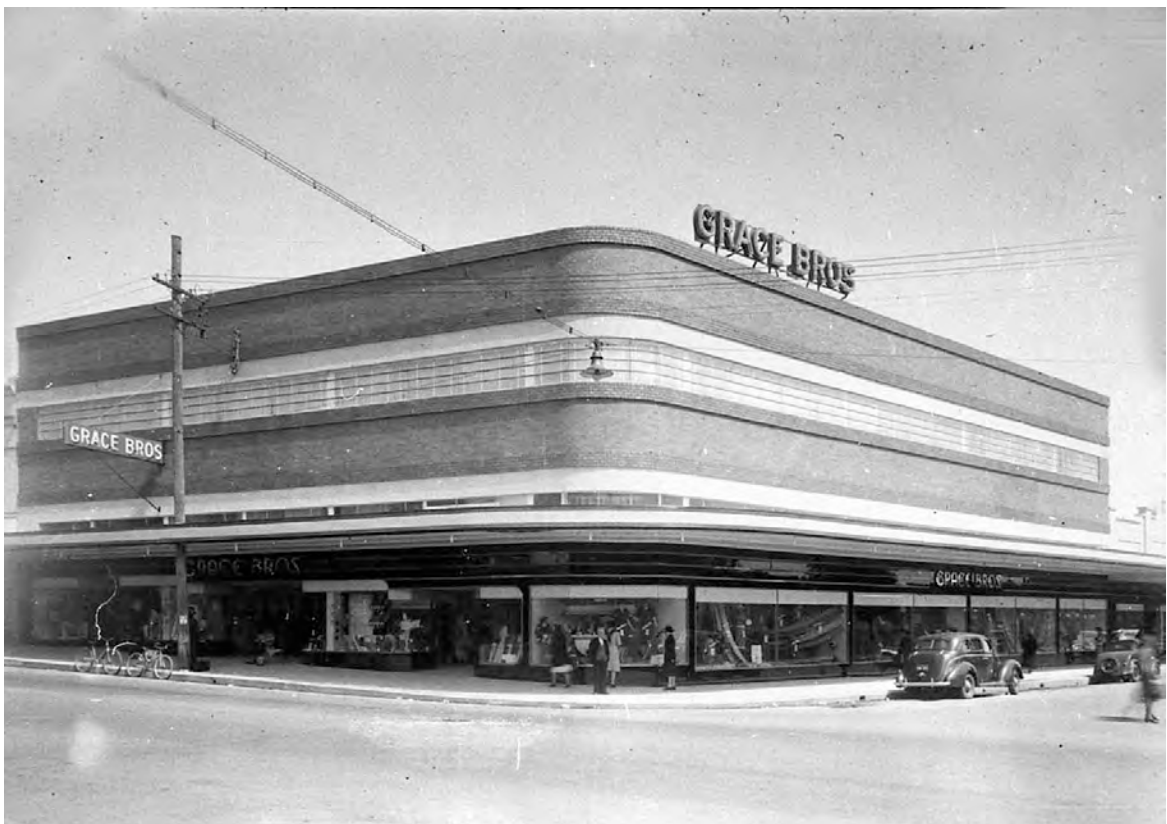
Figure 1.7 'Exterior, Grace Brothers, Parramatta'

from congestion and closer to where customers and workers lived. 91 Of the largest, Grace Bros had added a branch at Chatswood; David Jones had joined them at Parramatta; Anthony Hordern had opened at West Ryde; while Farmer's had a store at Gordon. The smaller department stores and 'general retailers' were more widely spread. Snows, Winns, McDowells, Waltons, Bebarfalds, Nock & Kirby, Marcus Clarke and Mark Foys dotted the more developed suburbs. Parramatta was the largest of these, followed by Bankstown, while Bondi Junction, Chatswood, Hurstville, Fairfield, West Ryde, Burwood and Manly also had considerable retail development. 92