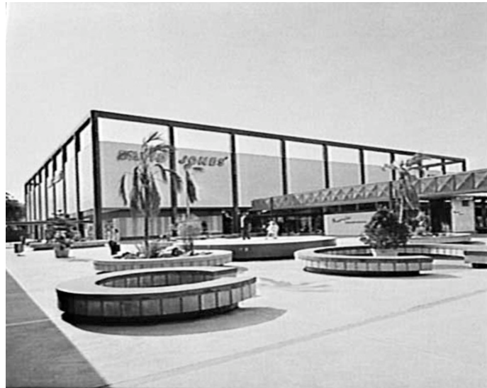
Figure 2.5: ‘David Jones’ new store, Warringah Mall, Brookvale’, 9 February 1963.