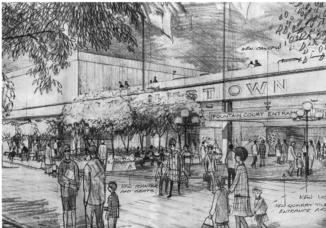
Figure 3.2: 'Bankstown Square Shopping Centre, Fountain Court Entrance' Bankstown City Council Library, Local Studies Collection, Bankstown Square File, Hely, Bell & Horne (Architects), Sydney, n.d.

Underlying much of the new purchasing power intrinsic to the Australian Way was the expansion of credit systems. Credit had been available in a variety of forms since the nineteenth century, but it flourished in the economic sun that had largely risen by the mid-1950s. 14 The retail industry attributed the finance boom to higher incomes; greater income regularity due to bi-partisan government support for full employment; early marriages with young couples trying to establish themselves; and improved 'security' in the form of insurance, superannuation, and institutional savings which made people 'more willing to incur debt'. 15 The economy had industrialised significantly during the war and there had been a successful transition of this industry to peacetime manufacturing. Wages were high and rising. Unemployment, particularly in the 1960s, was almost negligible. The stability of the economy, jobs and wages gave people the confidence to borrow.