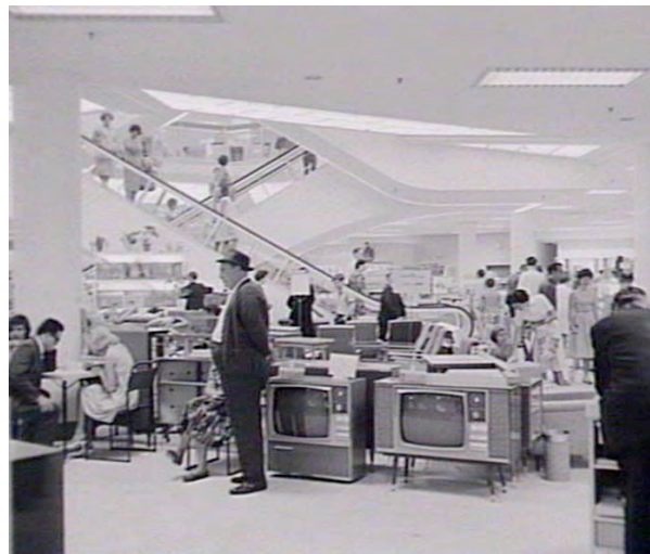
Figure 3.1: Television sets on sale at Miranda Fair, 1964.

The changes identified by Brett, are useful for understanding cultural historian Richard White’s analysis of the ‘Australian Way of Life’. White argues that Australia changed its self-understanding in the post-war period. The old nationalistic, rural, white and masculine Australian type passed away – although its ghostly trails still linger in mateship, ANZAC, sporting culture and elsewhere – to be replaced by the ‘Australian way of life’; an American import adapted to local conditions. Vaguely defined, it operated as a unifying ideology in the Cold War climate and, according