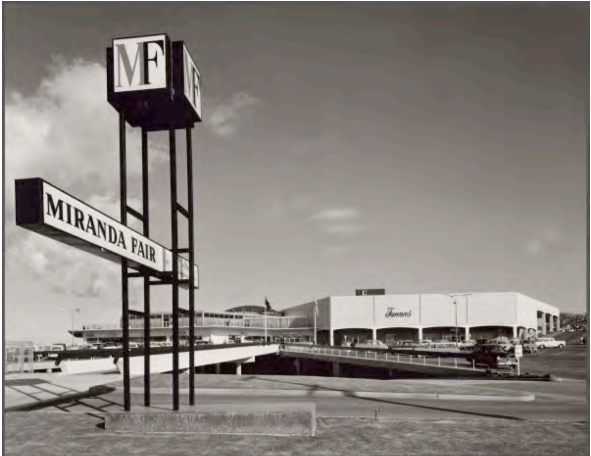
Figure 2.3: ‘Exterior and car park of Miranda Fair shopping centre, Miranda, New South Wales’

embraced shopping centre investment, eager for the infrastructure and ‘progress’ it brought without significant municipal expense – except for the odd public road or open space that a centre might enclose.