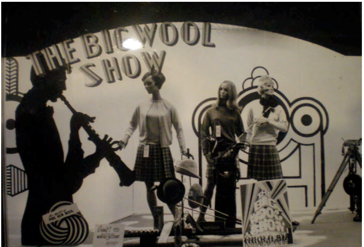
Figure 3.7: Grace Bros Window Display, Chatswood, c1965

were often viewed by management as odd and arty, to manufacture their own props. In the Fifties more pre-produced items became available, and by the 1960s (see Figure 3.7), display was being given increasing focus as an essential sales tool, with managers urged to integrate store displays with other promotional material. 113 An artistic influence remained, however, and interactions between display departments and straitlaced management were not always smooth. When Tilly received a command ‘to pull his finger out’ from the store manager, Pauline recalls, he sent a mannequin’s broken off finger back up to the office in reply. It was also not uncommon for the display staff to run through the store with a naked mannequin, shrieking with laughter as they clutched at its crutch or breast. 114