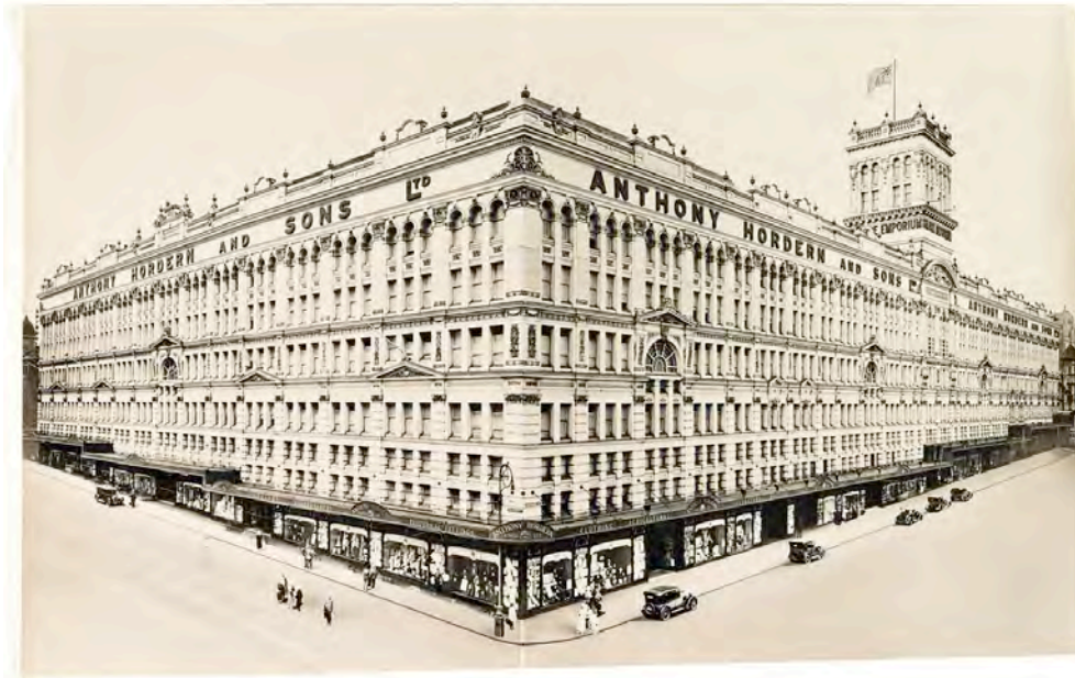
Figure 1.2: 'Anthony Hordern and Sons Palace Emporium, 1935'

technological developments in lighting and plate glass manufacture, store windows were turned into mini theatres that combined amusement with product promotion. 13