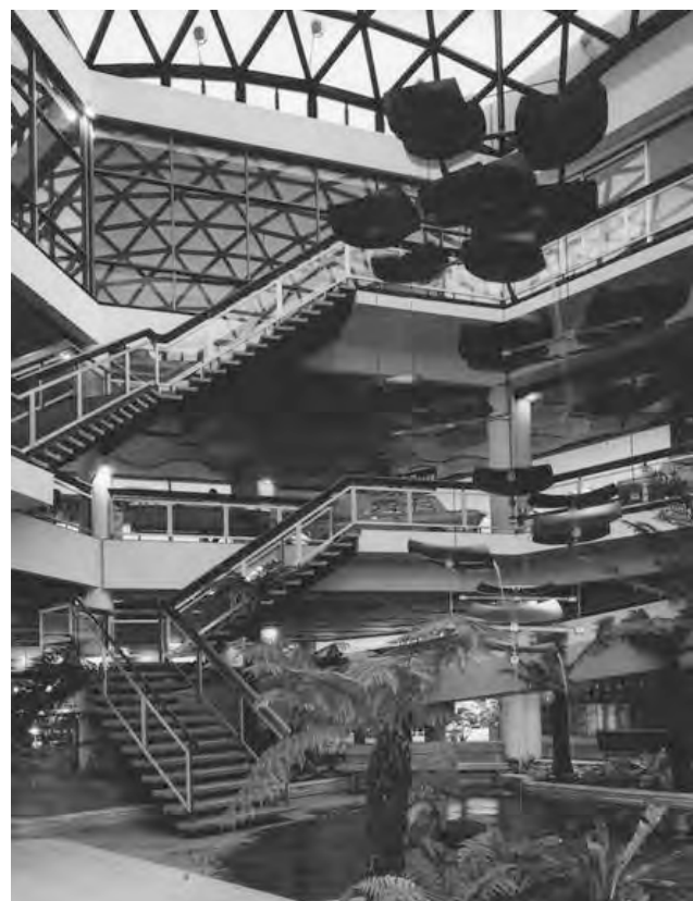
Figure 3.5: Wolfgang Sievers, ‘Interior water feature at Miranda Fair shopping centre, Miranda, New South Wales’

Air conditioning was a major symbol of modern life. All new shopping centres in Australia emphasised it in their opening promotions. The million-dollar system at Bankstown Square, for example, was said to keep the building at a constant a ‘springtime’ temperature of 71