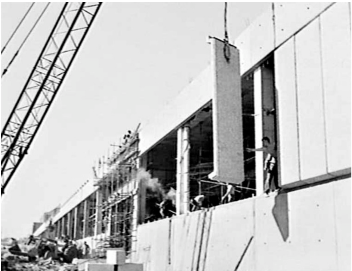
Figure 2.4: 'Crane hoists concrete wall panels into place on exterior of Bankstown Square shopping mall'

hole the size of six football fields. Below this, a grease trap as big as a house was dug to take sediment from the Square's food outlets. A new type of lightweight concrete was mixed in a plant specially set up on the 20-acre site, before being transported on a monorail system in dozens of huge buckets to movable concrete forms that were themselves wheeled from one pouring to another. This all had to be done extremely accurately. The length of the building was 900 feet and from one end to the other, the maximum margin for error was 1/8 of an inch. The job was, according to the Sydney Morning Herald , 'carried out with the precision of an army invasion.' 119 The concrete alone cost the developers $1 million. One-and-a-half million bricks were laid. Three-hundred-and-fifty miles of cable ran through twenty miles of conduit in the Square's electrical network. 120