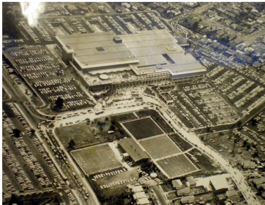
Figure 3.10: Roselands opening day traffic, October 1965

We were given sample bags. What a hoot - and on a SCHOOL DAY! One of the wonders was that the department store – Benjamin’s – a 3-story affair, had ESCALATORS! We only saw them when we went into the city in school holidays. 162