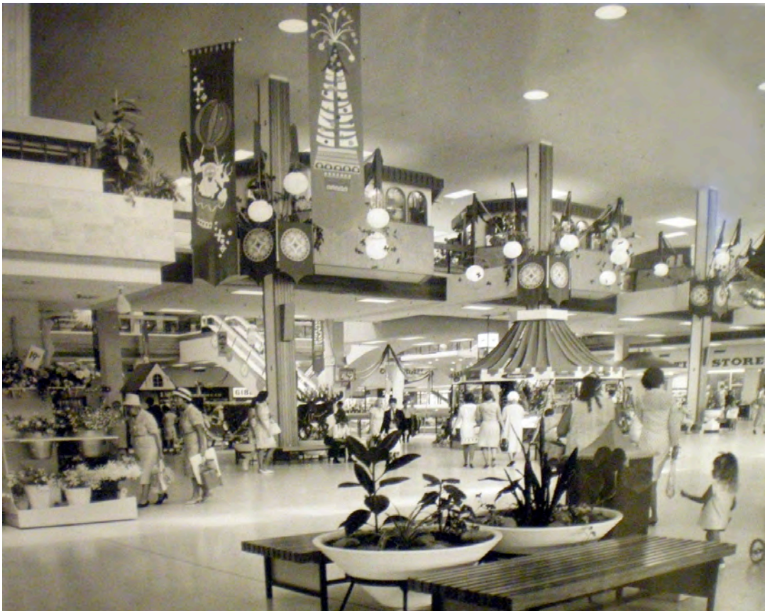
Figure 3.3: Roselands interior, 1965

your slacks or casual clothes'. 30 An advertisement for Roselands, clearly targeting women, told prospective customers that at the 'luxurious shopping showplace': all around you is beauty, brilliance and bounteous colour' in an atmosphere that is 'relaxing, happy casual – contagious'. 31 The invitation to be casual did not mean an abandonment of standards; Grace Bros still employed floorwalkers with white carnations in their lapels, and the selling staff still all wore black and white. 32 But the customers did not have to reciprocate with their attire to the level they had done in the city. Figure 3.3 is an internal shot of Roselands on its opening day in 1965. It is bright, clean, and spacious, suggesting that the facilities, style and sophistication of the city were now available in a convenient and relaxed complex, close to home.