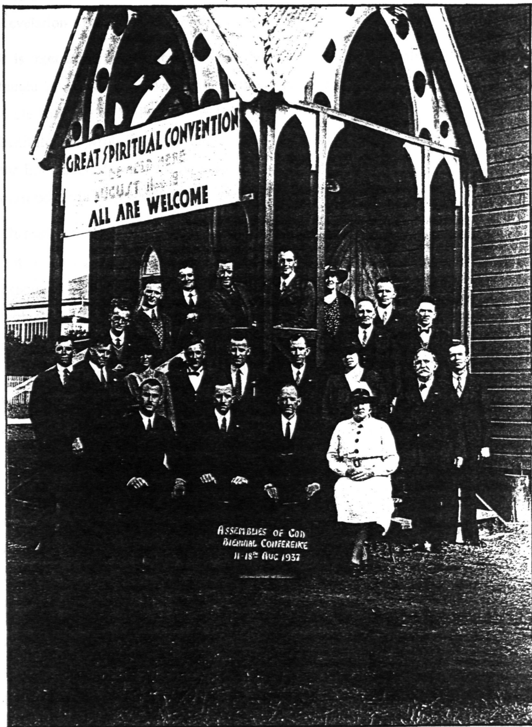
Assemblies of God Conference in Cairns 1937