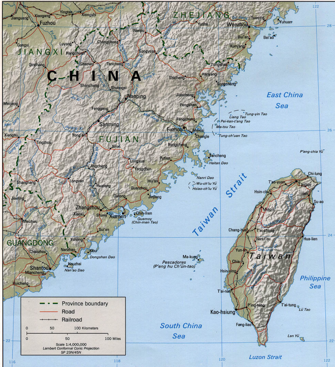
Taiwan Strait Area